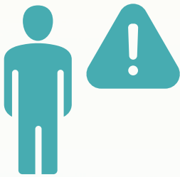
The Time Crisis in DEI

Our highly-interactive sessions, led by esteemed industry experts, delve into five essential areas that are crucial to the success of DEI initiatives.