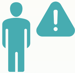
The Time Crisis in DEI

Our highly-interactive sessions, led by esteemed industry experts, delve into five essential areas that are crucial to the success of DEI initiatives.